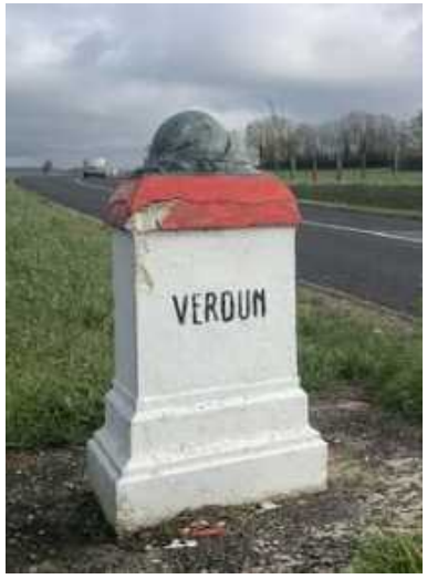
The start