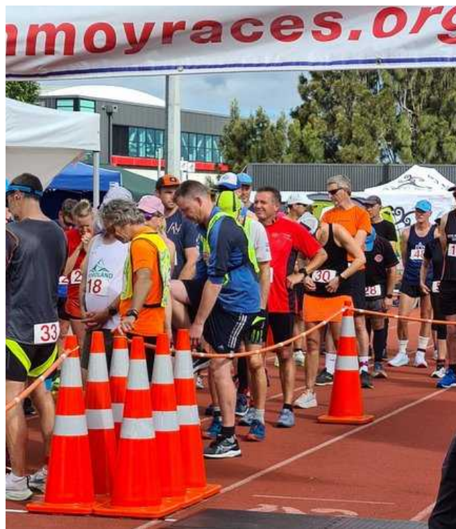
Walkers and runners ready for the start in Auckland