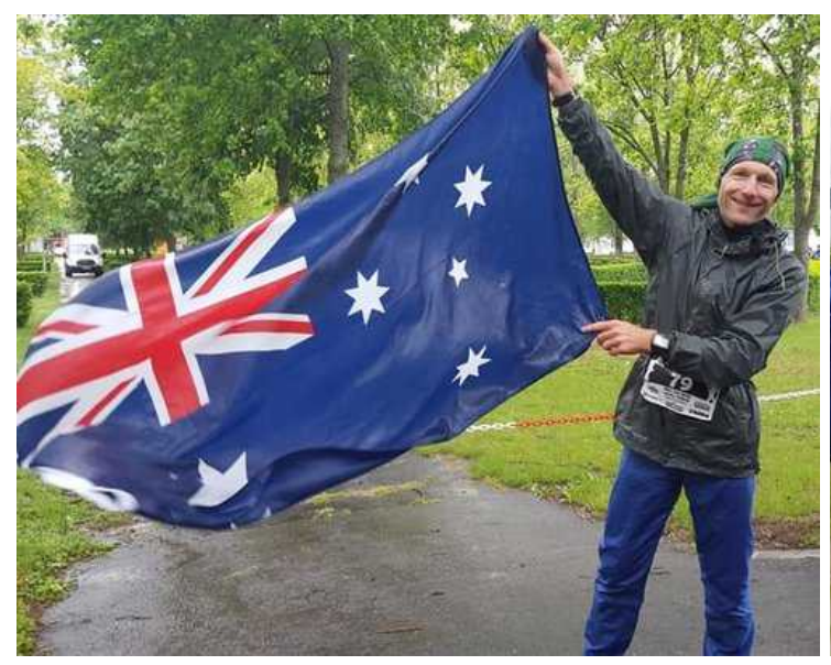
Day 2 onwards and it's wet and windy