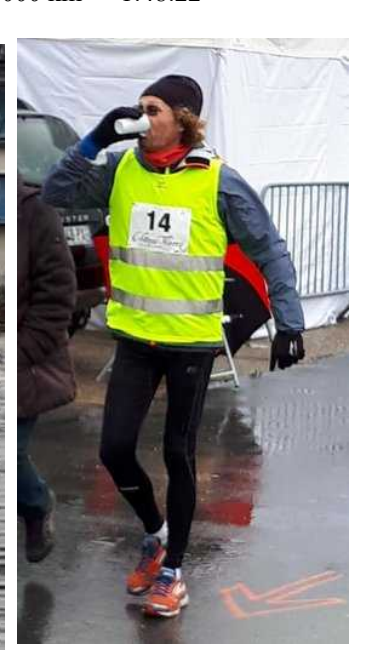
Rugged up at the start