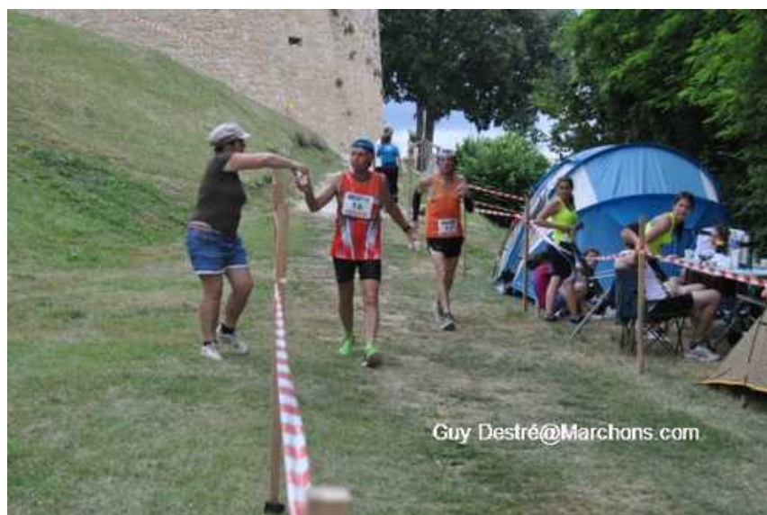
What does up must come down – a tough course in Montguyon

https://photos.google.com/share/AF1QipMzrjM2EnfHMhLrHWpEFFbGSEoc6NjSQoCJdv7zCkewzbpA2k2c49wz5oZnpaz3nA?hl=fr&key=aWpJdzBULXVZLUVVEVF9iWGND0GHVzZVX1IURWtB .