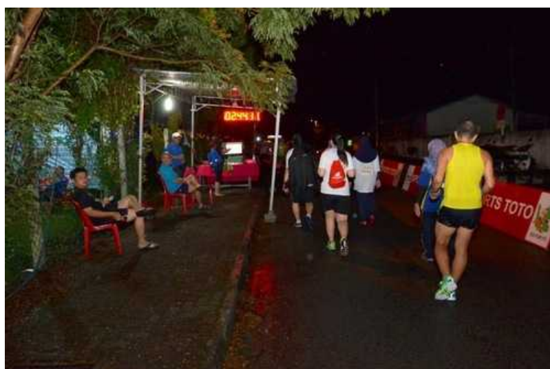
Walkers in action in Kajang