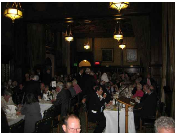
Enjoying dinner in the historic House of Lords