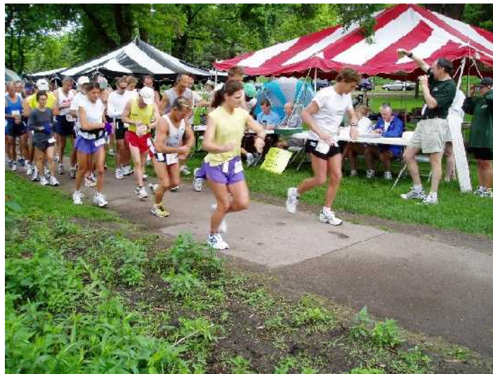
They're off

The latest American Centurion qualifier was held in conjunction with the 18 th Annual FANS 24 Hour Run, starting at 8AM on Saturday June 2. This is a huge event and 27 walkers joined the hundreds of runners who took up the challenge. See websites http://fans24hour.org/ and http://usatfmm.org/racewalk/events/2007centurion.htm Unfortunately none of the walkers made the magical 100 mile mark but the depth indicates that there are a number of good prospects out there. Walk results are as follows: